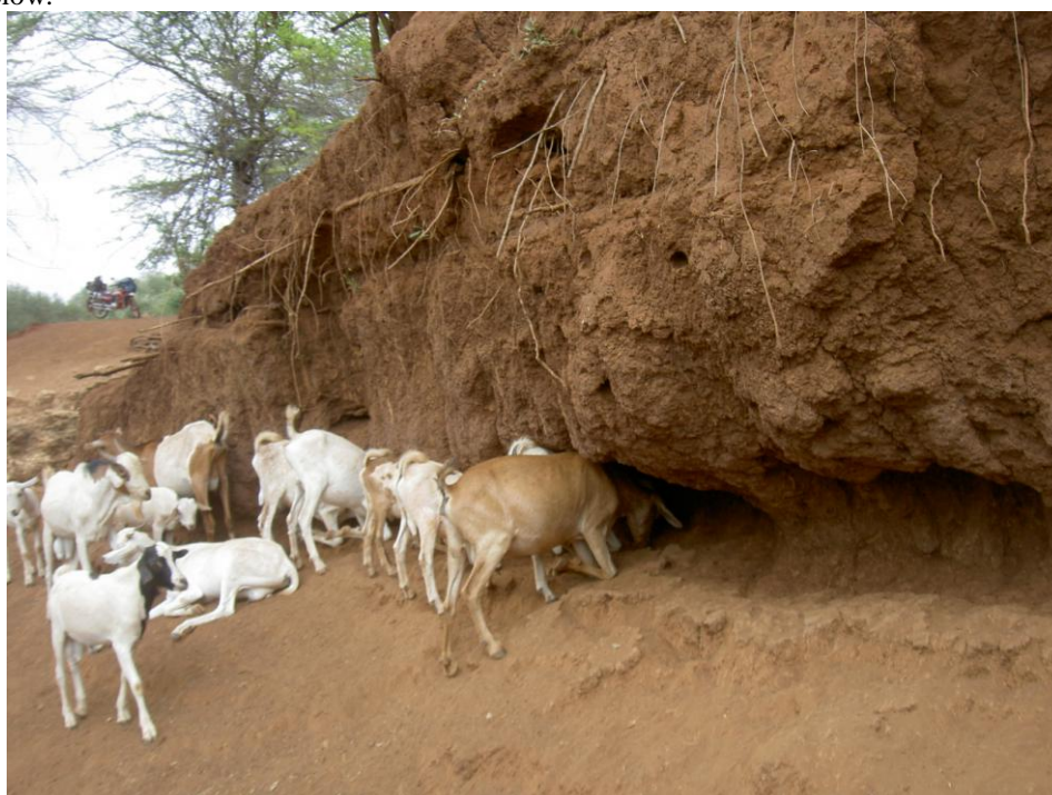
Figure 3: Goats consuming soils from a wall lick along a seasonal stream in Igambang'ombe Division, Tharaka-Nithi County

The wall licks (Kang'au, Kandondo, Gikurwe, Maara, Kabuai, Kigwanga, Riankui, M2, Kimenyi, Kieroo and Thuci) were found mainly along the banks of various seasonal streams in the study area as indicated in Fig. 3 below.