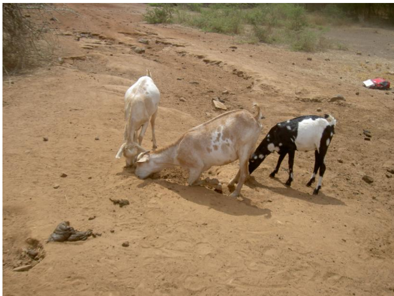
Figure 2: Goats consuming licks from an earth exposure lick in Igambang'ombe Division, Tharaka-Nithi County

Higher levels of potassium at Kibuuri lick may be associated with the natural weathering processes of the basement rocks and atmospheric deposition that is accompanied by low leaching effect due to high evaporation and low rainfall in the study area [37]. The absence of phosphorus in Kibuuri, Mikame and Ikindu licks might contribute to low energy metabolism in animals consuming the licks and hence causing depraved appetite in animals which makes them to abnormally consume inanimate objects like plastics [7]. The levels of cobalt were below detection limits in Nagundu and Kabariange licks, and this can interfere with the synthesis of vitamin B12 in ruminants that mainly depends on the soil lick from these sites as a source of essential minerals which might lead to emaciation and anemia in them. Animals can obtain all the essential minerals by mixing soil licks from Nagundu and Kabariange.